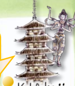
Kohfuku-ji Five-storied Pagoda

The second tallest 5-storied pagoda in Japan. Best viewed from across Sarusawa Pond.