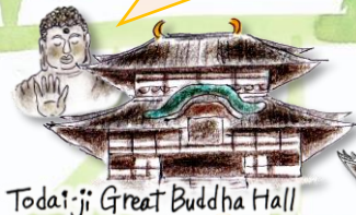
Todai-ji Great Buddha Hall

The Great Buddha enshrined in the world's largest wooden building. Let's say hello on arrival.