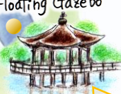
Ukimido Floating Gazebo

This photogenic gazebo seems to float on Sagi-ike pond. Its graceful figure reflected on the water's surface is a must-see!